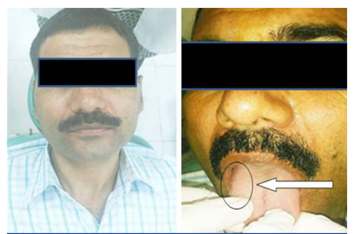
[Table/Fig-1]: Patient profile picture and swelling (white arrow)

Aspiration (fine needle aspiration) of swelling was done yielding 0.2-0.5 ml of scanty material which showed deep blue nuclei in the background of fibrilar material. Smear also showed mixed inflammatory infiltrate showing possibility of cysticercosis. Patient was advised with various investigations, and on haematological investigations all the values were within normal limits except for the elevated ESR suggestive of parasitic infection. As the lesion was soft in consistency, so ultrasound of swelling using most latest version P8 4D was done which showed cyst of approximately 4 mm